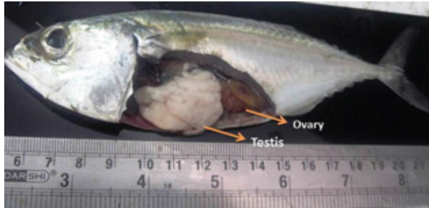
Fig. 1. Hermaphrodite mackerel with male and female gonads

weight of testis and ovary were 0.67 and 2.82 g respectively. Histological analysis showed that the ovary and testis were similar to other normal gonads and they were in spent stage. The present observation was different from that of earlier records of hermaphroditism in mackerel, where in the same gonad, one part was functional as ovary and the other as testis. Parasitism may be a cause for hermaphroditism, but in the present instance parasite infestation was not observed.